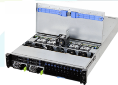
Ultra-Dense Multicore Server